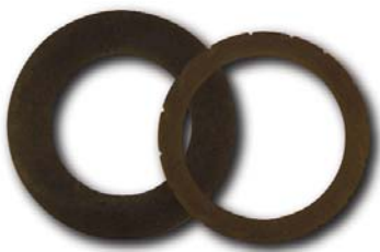
Resin Blades for Ceramic BGAs

Other thicknesses, diameters, edge geometries and diamond grit sizes are available upon request.