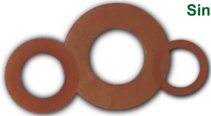
Sintered Blades for Plastic BGAs