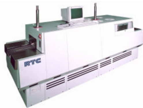
LA-309 furnace: 30 inches of heat, 9 inch wide belt.