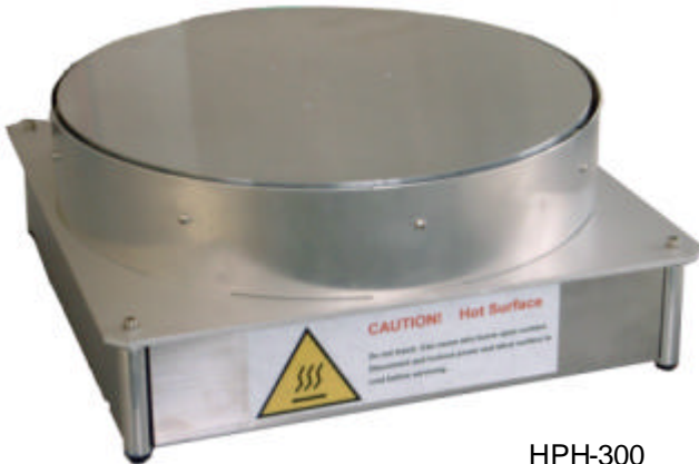
HPH-300 stand-alone version